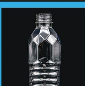
Product Name: Diamond Bottle Size: 500ml Neck Size: 30 Neck Type: Screw Color: Clear