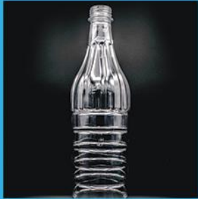
Product Name: Fine Bottle Size: 1000ml Neck Size: 30 Neck Type: Screw Color: Clear