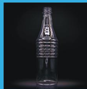
Product Name: Ajmal Bottle Size: 750ml Neck Size: 30 Neck Type: Screw Color: Clear