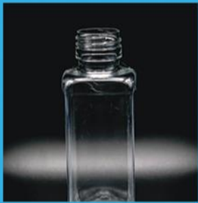
Product Name: Square Bottle Size: 100ml Neck Size: 25 Neck Type: Screw Color: Clear