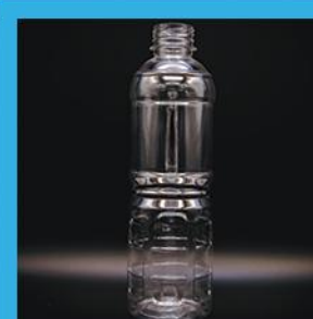
Product Name: Round Juice Bottle Size: 500ml Neck Size: 30 Neck Type: Screw Color: Clear