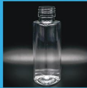
Product Name: Triangle Bottle Size: 100ml Neck Size: 25 Neck Type: Screw Color: Clear