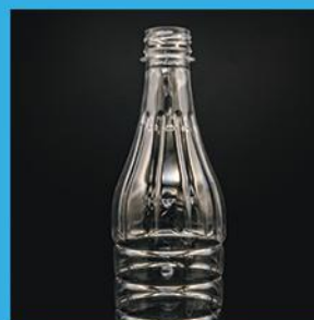
Product Name: Fine Bottle Size: 800ml Neck Size: 30 Neck Type: Screw Color: Clear