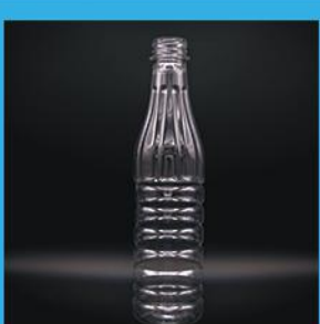
Product Name: Fine Bottle Size: 500ml Neck Size: 30 Neck Type: Screw Color: Clear