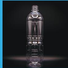
Product Name: Round Juice Bottle Size: 1000ml Neck Size: 28 Neck Type: Screw Color: Clear