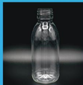
Product Name: Pharma Regular Bottle Size: 90ml Neck Size: 25 Neck Type: Screw Color: Clear