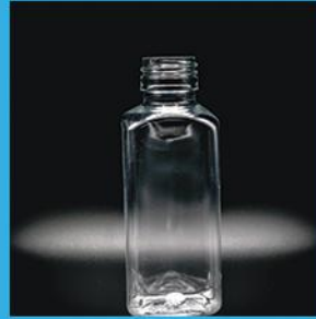
Product Name: Rectangle Bottle Size: 100ml Neck Size: 25 Neck Type: Screw Color: Clear