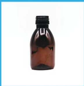
Product Name: Pharma Special Bottle Size: 90ml Neck Size: 25 Neck Type: Screw Color: Amber