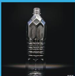
Product Name: Diamond Bottle Size: 1000ml Neck Size: 28 Neck Type: Screw Color: Clear