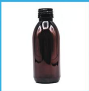
Product Name: Pharma Regular Bottle Size: 90ml Neck Size: 25 Neck Type: Screw Color: Amber