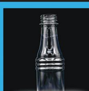
Product Type: Small Product Name: Ajmal Bottle Size: 250ml Neck Size: 30 Neck Type: Screw Color: Clear