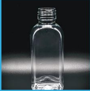
Product Name: Pharma Arch Bottle Size: 100ml Neck Size: 25 Neck Type: Screw Color: Clear